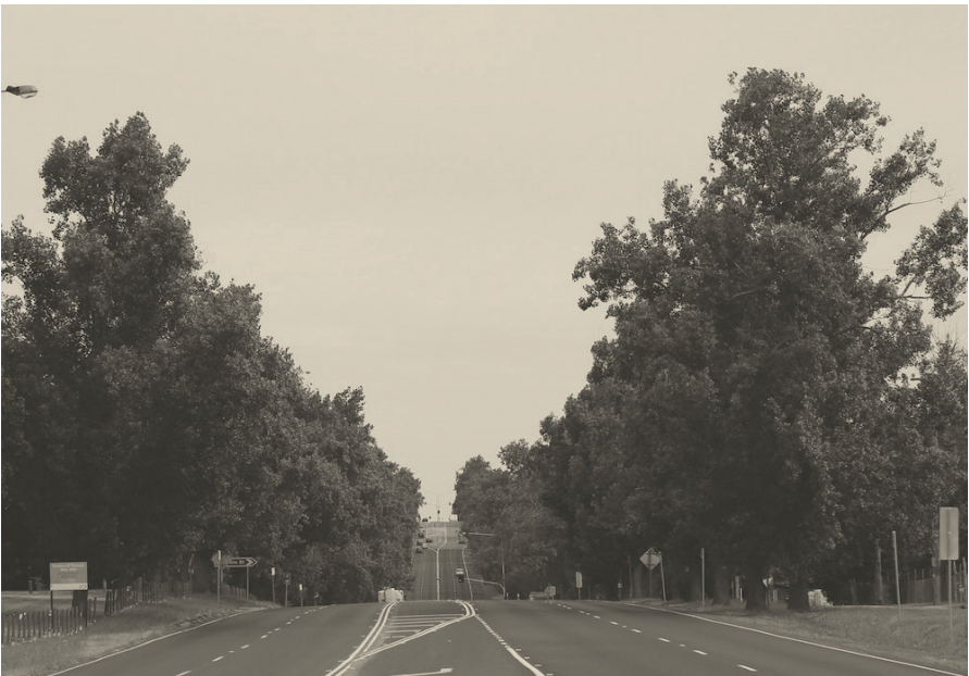
Beaconsfield Avenue of Honour - Spring