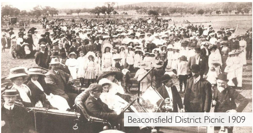
Beaconsfield District Picnic 1909