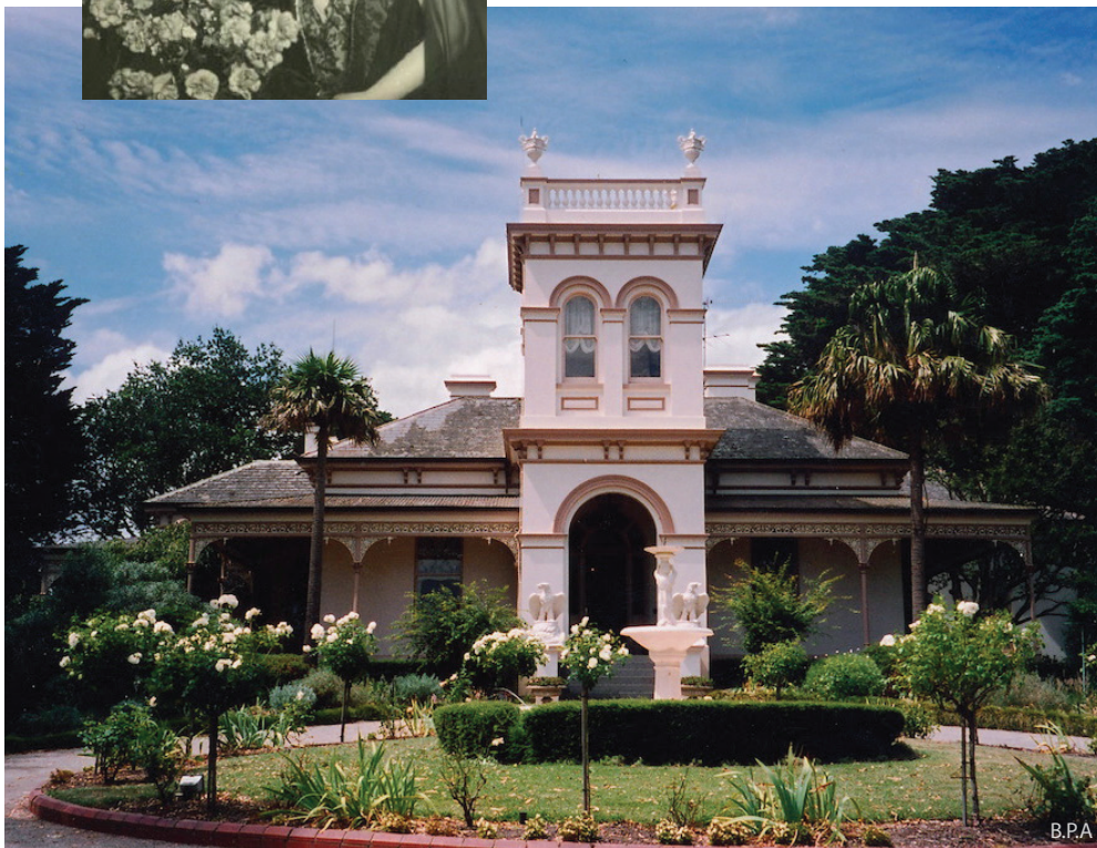
Holm Park - Home of Ada Armytage Ada Armytage pictured in insert