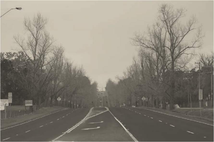
Beaconsfield Avenue of Honour - Winter