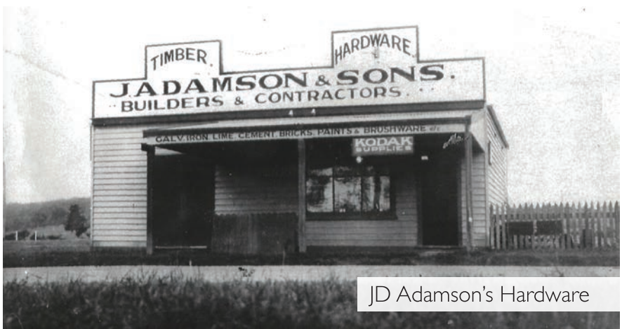
JD Adamson's Hardware