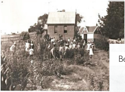
Beaconsfield School 1910